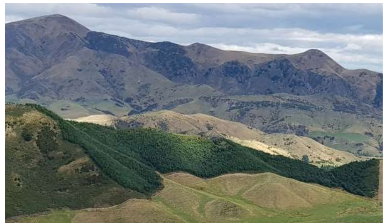
The west side of the Glens of Tekoa stand, 2018