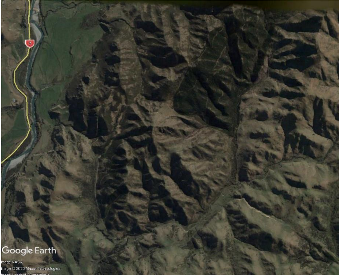
Leslie Hills Forest April 2003 Just LH1 showing up, aged 8